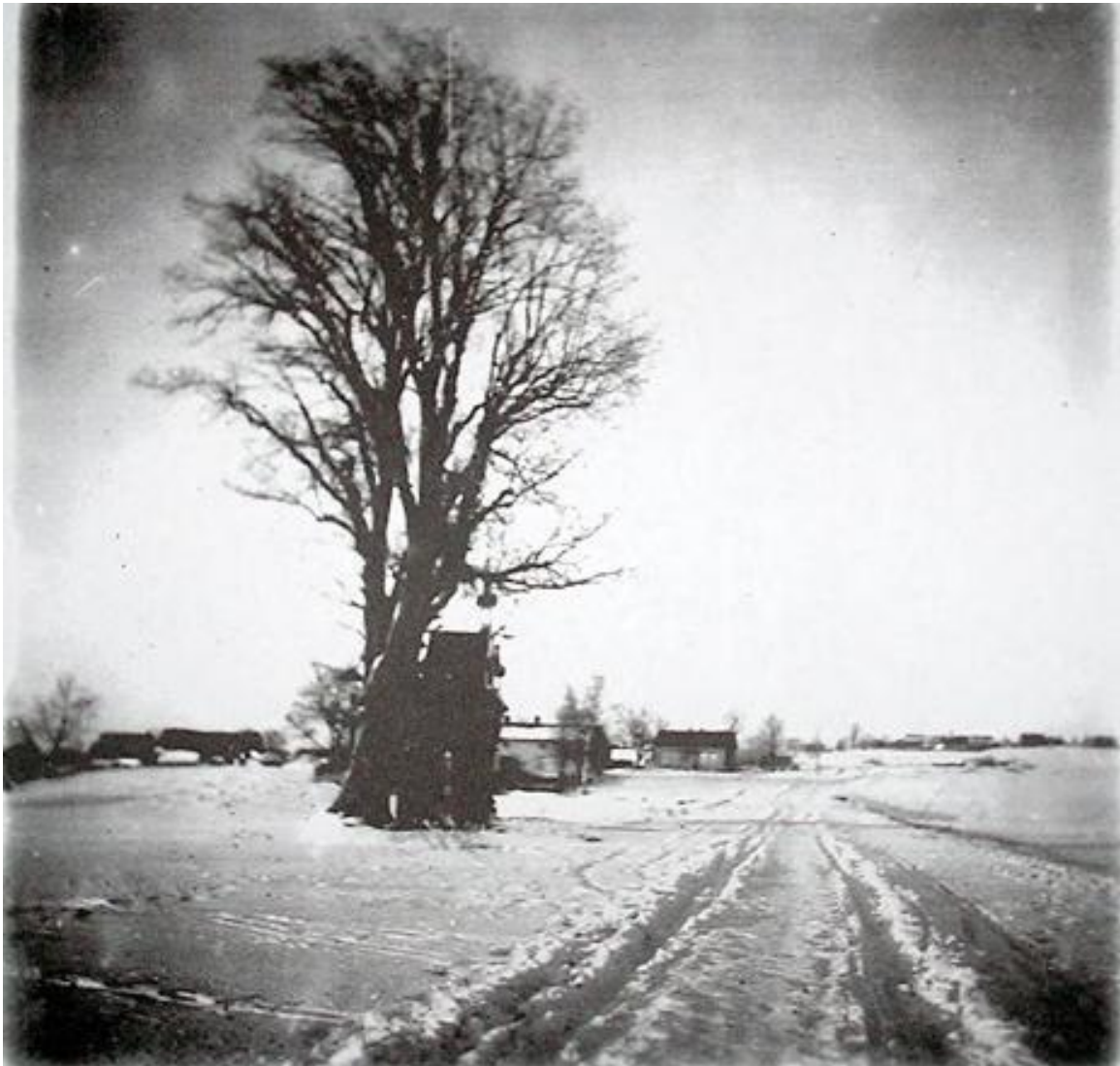
Cegielniana street, a chapel under a tree, buildings on the odd side in the distance (source: https://zcalegoswia2.blogspot.com/2016/10/dawniej-dzis-przedm.html )

Apart from a few Augsburg Evangelicals, the street was inhabited by Roman Catholics and only one Jewish family.